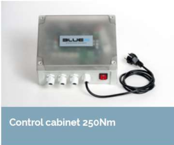
Control cabinet 250Nm