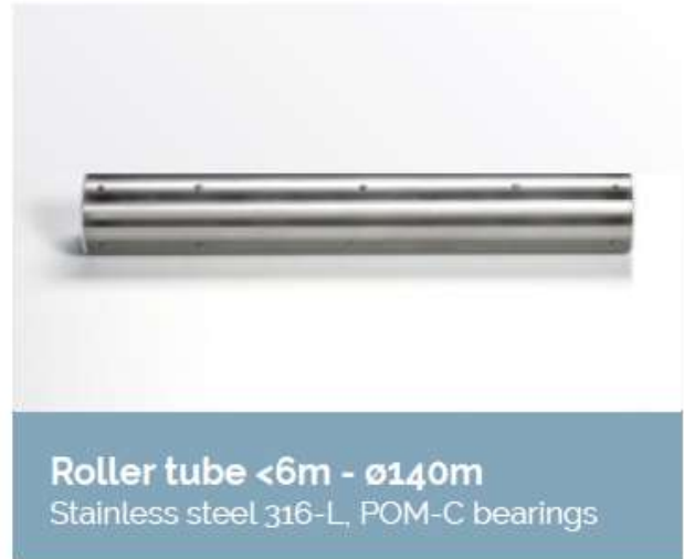
Roller tube <6m - Ø140mm Stainless steel 316-L, POM-C bearings